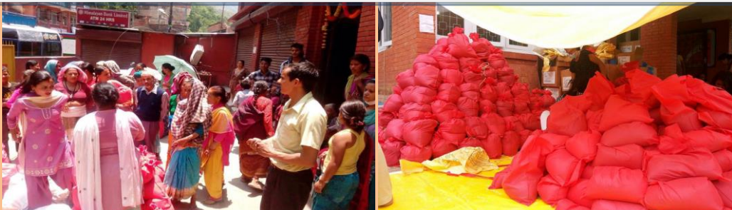
Our team has visited Sindhupalchok 3 times for relief program with 1200 packages.