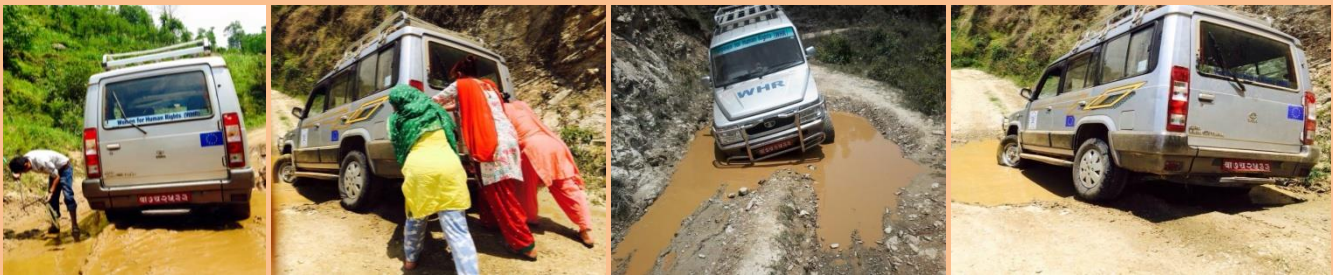
The road might be difficult but we will strive to reach our destination.