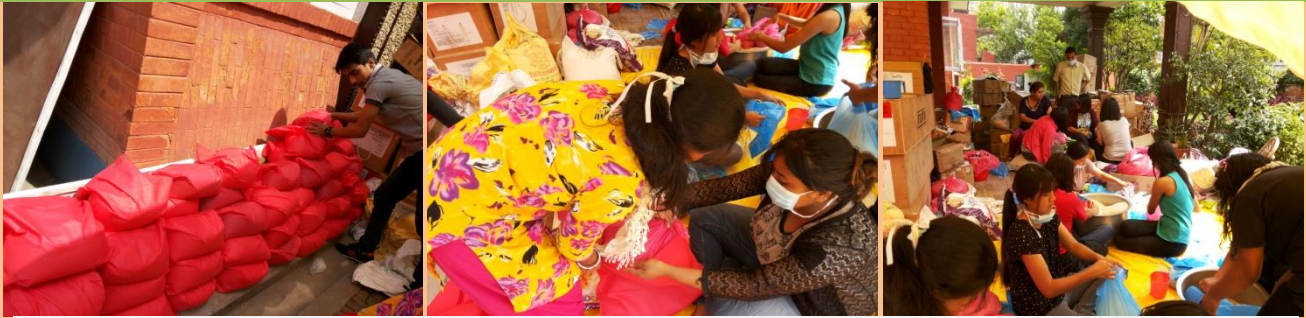
Volunteers preparing Relief 500 package to be distributed at “Dhading”