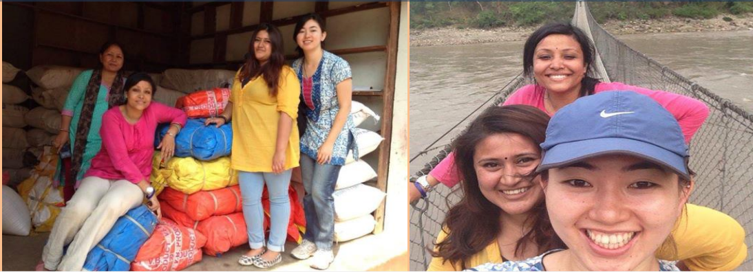
Gorkha Relief Program, where our staff and volunteers walked for a day to reach the destination.